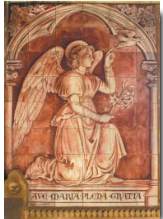
Angel Gabriel, Winkfield 6" x 4 1 / 4 "