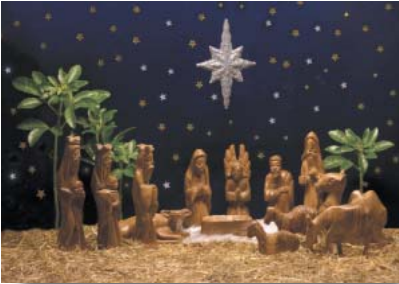
St. John's Nativity Scene 4 3 / 4 " x 6 1 / 2 "

All cards in packs of 10 with envelopes.