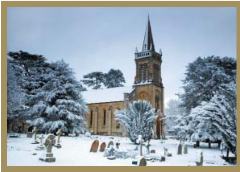
St. Mary's, Shaw 4 3 / 4 " x 6 1 / 2 "

With best wishes for a Happy Christmas and New Year