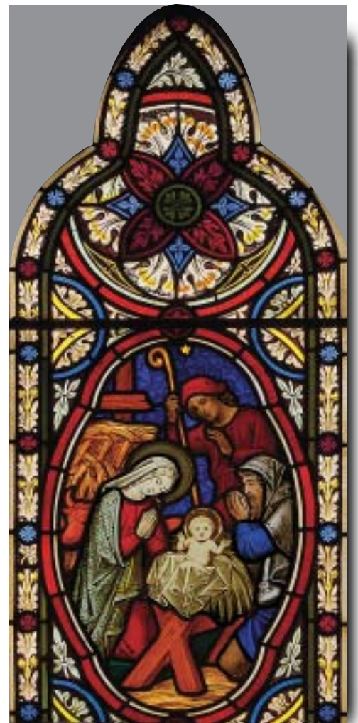
Woolhampton Nativity 8 1 / 2 " x 4"