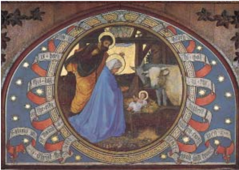
East Garston Nativity 4 3 / 4 " x 6 1 / 2 "