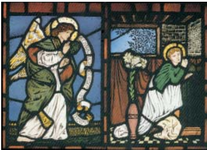
The Annunciation, Dedworth 4 1 / 4 " x 6"