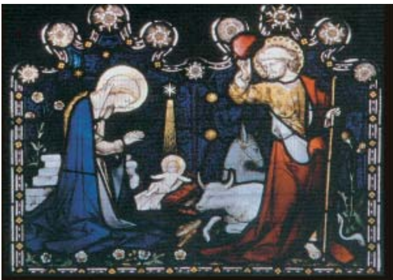
St. Nicolas Nativity 4 3 / 4 " x 6 1 / 2 "