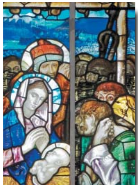
Bucklebury Nativity 6" x 4 1 / 4 "