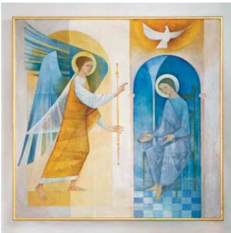
The Annunciation, St. George's Wash Common 5 1 / 4 " x 5 1 / 4 "