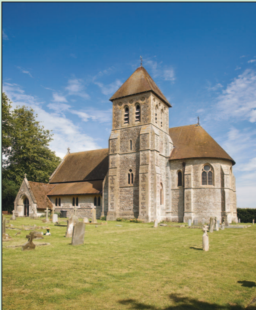
St. Mary's Fawley.